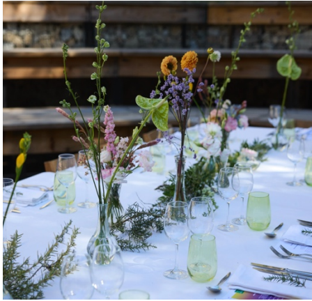
Wild wild menu, Sami Tallberg