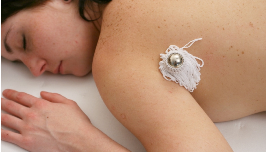
Robot Tickle Salon 2.0.

strokes are most pleasurable to them by means of a two-button control, information that the robot will use to personalise the experience.